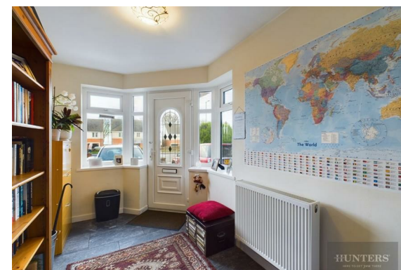
Augusta Terrace, Whitburn, Sunderland, Tyne & Wear, SR6 7ET